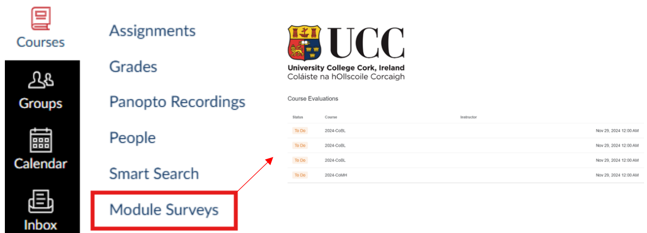
Figure 2 – Screenshot of student view of Canvas where feedback survey for modules can be accessed.

The survey utilises the surveying platform Qualtrics and will be at a module level. It will be integrated onto UCC's virtual learning platform Canvas to enable easy access for students. A core survey (Appendix I), developed in collaboration with academic staff and students with feedback received from across consultative fora including Academic Council and Academic Board, will be automatically integrated for all modules on Canvas and will be accessible under the Assignments section of Canvas (Figure 2).