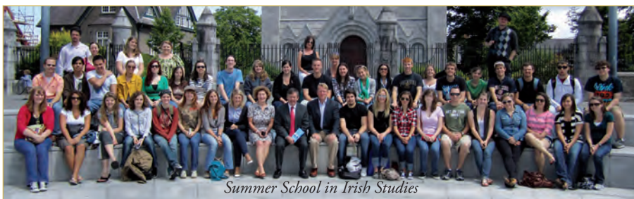
Summer School in Irish Studies

The Summer School in Irish Studies in UCC aims to provide a unique learning experience by combining a rigorous introduction to major academic themes in the development of Irish identity with an opportunity to encounter Ireland's rich cultural landscape.