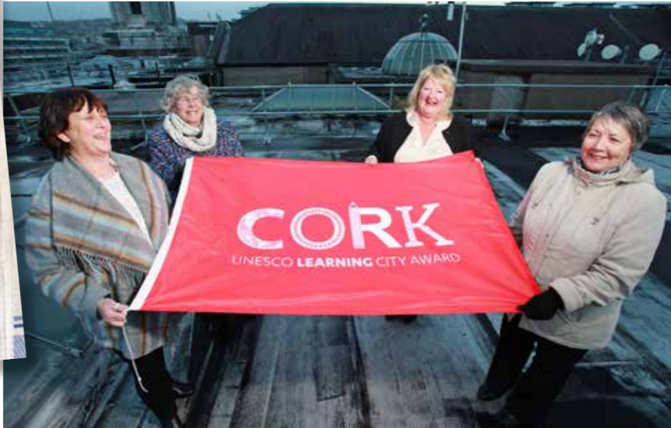
Residents of Knocknaheeny, pictured at the Lord Mayor's Reception to celebrate Cork's receipt of the UNESCO Learning City Award, 17th December 2015, City Hall

While the Ballypheane and Knocknaheeny neighbourhoods face social and educational disadvantage, both have active community and education organisations and networks that are open to developing further learning opportunities, which is crucial to the success of Learning Neighbourhoods.