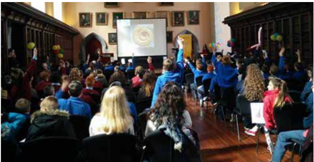
School children participate in the fossil lecture during ‘The Free University’, Aula Maxima, UCC