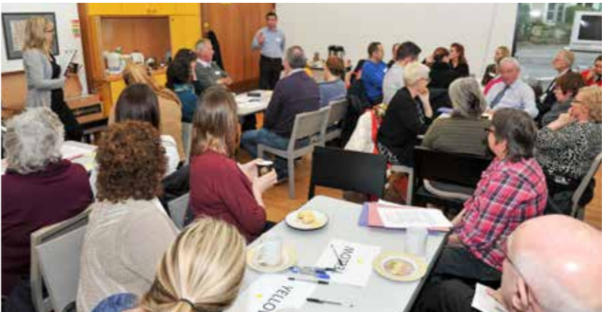
Learning Neighbourhoods Workshop, Tory Top Library, Ballyphehane, 24th November 2015