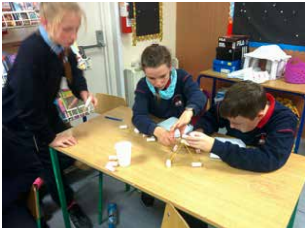
Children participating in STEAM classes in Scoil Padre Pio