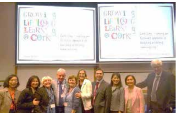
Cork and Taipei Delegates at the PASCAL International Conference