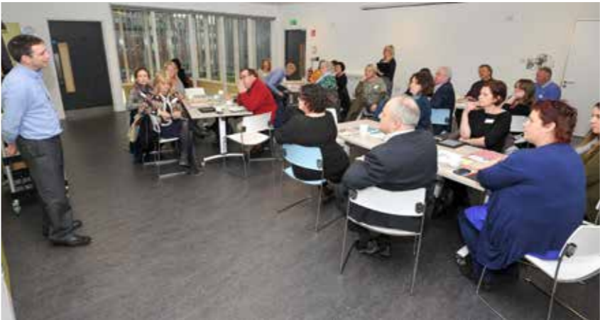
Learning Neighbourhoods Workshop, Hollyhill Library, Knocknaheeny, 3rd December 2015

Following the workshops, two neighbourhood coordinating groups were established with members drawn from local education networks, community centres, schools, senior centres, health groups, youth groups, etc. In Knocknaheeny, an existing education network formed the basis for the Learning Neighbourhoods coordinating group, which was broadened to include additional community and education groups.