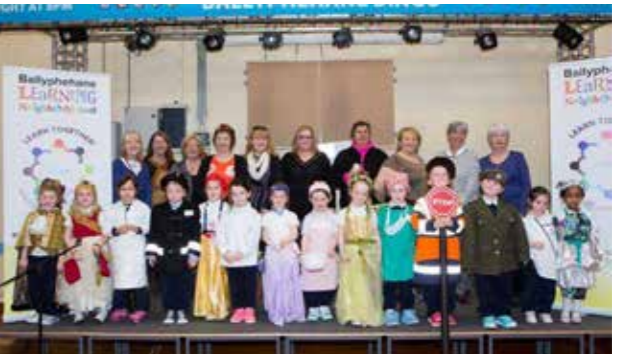
Ballyphehane Arts and Crafts Initiative with students from Maria Assumpta National School ‘Dress up for Learning’