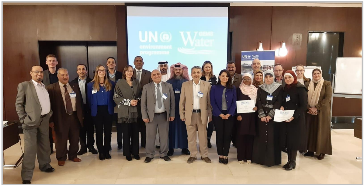
The participants of the workshop together with the GEMS/Water team

The current limitation of offering capacity development for SDG Indicator 6.3.2 and the other activities predominantly in English limits accessibility in the West Asia and North Africa region. Arabic was suggested as an additional language.