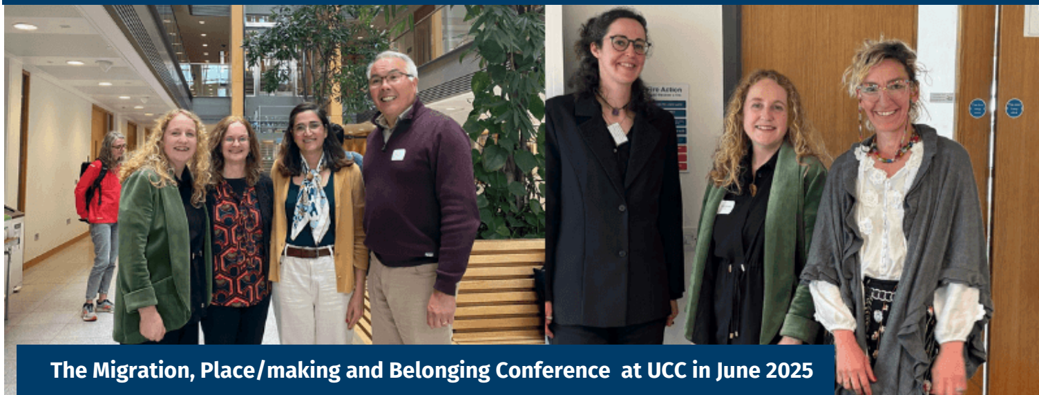
The Migration, Place/making and Belonging Conference at UCC in June 2025