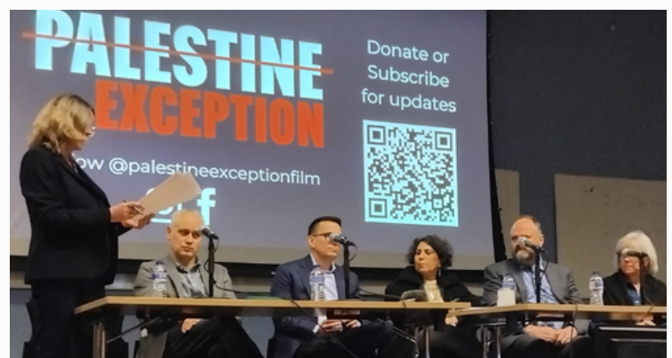
Panel discussion after The Palestine Exception