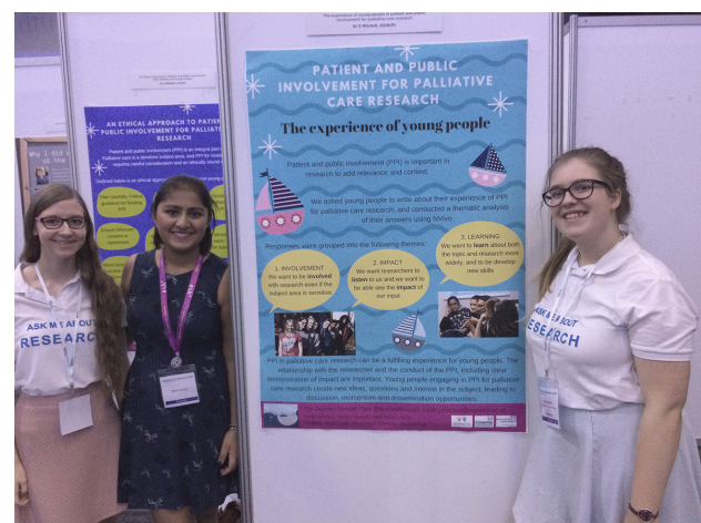
Figure 2 Patient and public involvement group members at the Royal College of Paediatrics and Child Health conference 2017.

Given the potential risk of harm to PPI group members through conversations about palliative care, our approach to PPI included a brief risk assessment as described in table 2: