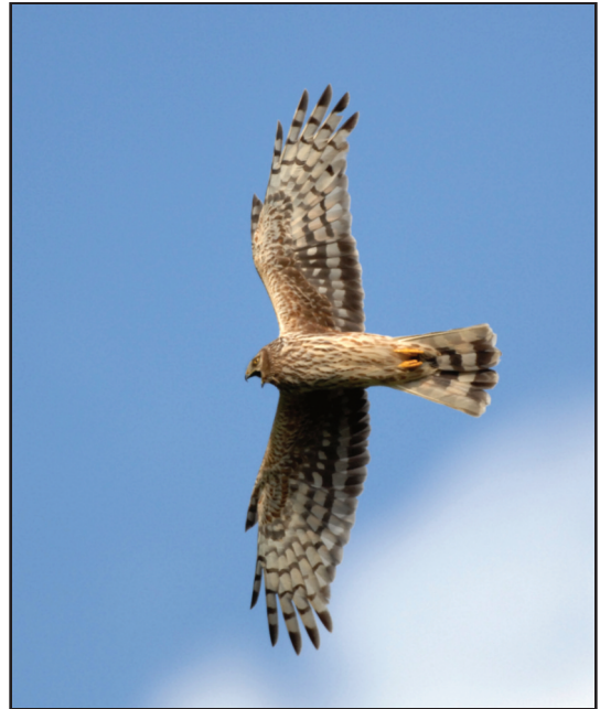
Plate 3. Hen Harrier (Richard T. Mills).

The on-going maturation of the existing forest estate will lead to a reduction in the extent, and greater fragmentation, of upland habitats that are suitable for breeding Hen Harriers. In the absence of open heather moorland, Hen Harriers in Ireland typically use pre-thicket coniferous plantations for nesting and foraging (Wilson et al. 2009, 2012; Irwin et al. 2012; Ruddock et al. 2016). These areas may offer nest concealment and protection from predators, though their efficacy in this regard when compared with heather moorland has not been established. Pre-thicket forests are also often lacking the Hen Harrier's preferred avian prey species, Meadow Pipit ( Anthus pratensis ) and Skylark ( Alauda arvensis ), and other open-country passerines (e.g. Wilson et al. 2006; AMcC, unpublished data). Hen Harriers in Ireland will also take small mammals, such as bank voles ( Clethrionomys glareolus ) and wood mice ( Apodemus sylvaticus ) (O'Donoghue 2010). However, in contrast to avian prey, small mammals typically prefer areas with dense ground