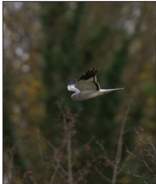
Plate 2. Hen Harrier.

creation and maintenance of open spaces in the uplands included no afforestation, no thinning, clearfell, permanent forest removal and fire (Table 3).