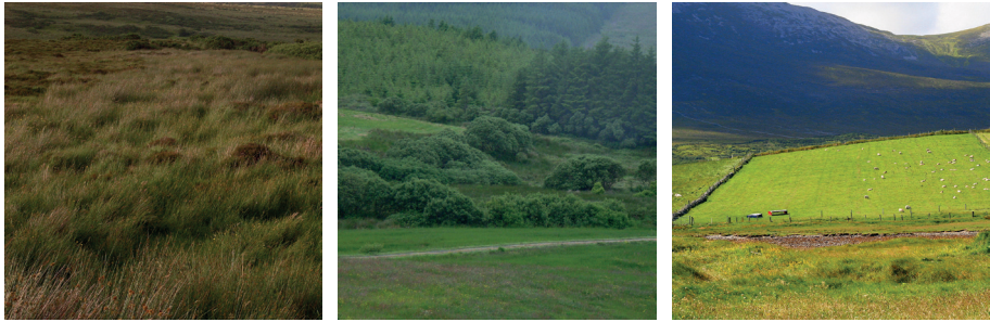
Figure 2: From left to right: Peatland, Wet grassland and Improved grassland habitats (Photos: Mark Wilson and Catherine Bushe).

found in forest plantations. Because of its relatively low value for bird communities, afforestation of intensively managed grassland has a more positive impact on bird diversity than afforestation of low intensity agricultural grassland, particularly where the latter has high levels of in-field shrub cover or supports open habitat specialists (Wilson et al. 2012). Peatland sites tend to have low bird diversity, but support relatively high densities of the open habitat specialists, meadow pipit and skylark.