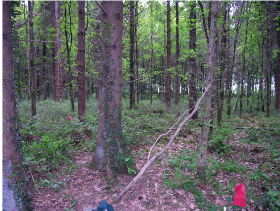
Figure 4: Mixed Norway spruce and oak plantation forest (Photo: Linda Coote).

the pre-thicket stage, levels of non-crop shrub cover are higher than in equivalently aged, first commercial rotation forests. As a result, several species of birds that breed in shrub-rich habitats are more abundant in second rotation pre-thicket forests (Figure 6) than in recently established afforested sites. Migrant songbird species have been found at significantly lower densities in closed canopy than in Thicket and Pre-thicket forests (Figure 6). The bird communities of these early stages are markedly distinct from those of closed canopy plantations. In addition to holding high densities of several migrant songbird species, second rotation pre-thicket stands also support resident species of conservation concern (Table 1). However, these species are not found in plantations following canopy closure at the mid rotation stage (Figure 6), but are replaced by a more generalist bird community, with high densities of just a few common species.