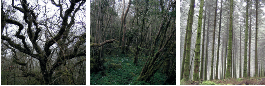
Figure 3: From left to right: native oak woodland, native ash woodland and mature non-native Sitka spruce plantation forest (Photo: Mark Wilson).

Sitka spruce plantations (Wilson et al. 2010). Non-crop vegetation in roads, rides and other unplanted areas was also associated with higher bird diversity. The higher bird species richness in these areas was, in large part, due to the presence of species that are known to be associated with broadleaves, and so responded to the increase in the cover of shrubs and broad-leaved trees (Figure 5). Non-crop vegetation can also have a positive effect on birds by enhancing the structural complexity of forest vegetation. This suggests that providing an opportunity for native trees and shrubs to grow by leaving unplanted areas in stands may partly compensate for the simpler structure and lack of broadleaved vegetation in areas of closed canopy conifers (Roycroft et al. 2008, Wilson et al. 2010). The magnitude of the positive effect of such unplanted areas will likely be determined by their overall size, with larger areas providing habitat for a greater number and diversity of birds. When incorporating an unplanted or open area in a forest there are advantages both of dispersing this area between a number of individual small spaces (to maximise the influence of non-crop vegetation on the wider forest (Bibby et al. 1989)) of configuring it as a single large area (to better suit species with large habitat requirements (Langston et al. 2007)).