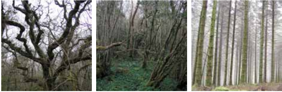
Figure 3: From left to right: native oak woodland, native ash woodland and mature non-native Sitka spruce plantation forest (Photo: Mark Wilson).

Sitka spruce plantations (Wilson et al. 2010). Non-crop vegetation in roads, rides and other unplanted areas was also associated with higher bird diversity. The higher bird species richness in these areas was, in large part, due to the presence of species that are known to be associated with broadleaves, and so responded to the increase in the cover of shrubs and broad-leaved trees (Figure 5). Non-crop vegetation can also have a positive effect on birds by enhancing the structural complexity of forest vegetation. This suggests that providing an opportunity for native trees and shrubs to grow by leaving unplanted areas in stands may partly compensate for the simpler structure and lack of broadleaved vegetation in areas of closed canopy conifers (Roycroft et al. 2008, Wilson et al. 2010). The magnitude of the positive effect of such unplanted areas will likely be determined by their overall size, with larger areas providing habitat for a greater number and diversity of birds. When incorporating an unplanted or open area in a forest there are advantages both of dispersing this area between a number of individual small spaces (to maximise the influence of non-crop vegetation on the wider forest (Bibby et al. 1989)) of configuring it as a single large area (to better suit species with large habitat requirements (Langston et al. 2007)).