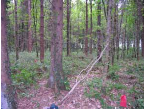
Figure 4: Mixed Norway spruce and oak plantation forest.

the pre-thicket stage, levels of non-crop shrub cover are higher than in equivalently aged, first commercial rotation forests. As a result, several species of birds that breed in shrub-rich habitats are more abundant in second rotation pre-thicket forests (Figure 6) than in recently established afforested sites. Migrant songbird species have been found at significantly lower densities in closed canopy than in Thicket and Pre-thicket forests (Figure 6). The bird communities of these early stages are markedly distinct from those of closed canopy plantations. In addition to holding high densities of several migrant songbird species, second rotation pre-thicket stands also support resident species of conservation concern (Table 1). However, these species are not found in plantations following canopy closure at the mid rotation stage (Figure 6), but are replaced by a more generalist bird community, with high densities of just a few common species.