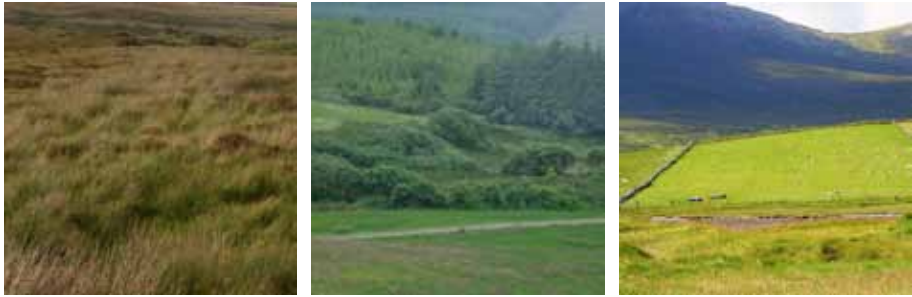
Figure 2: From left to right: Peatland, Wet grassland and Improved grassland habitats.

found in forest plantations. Because of its relatively low value for bird communities, afforestation of intensively managed grassland has a more positive impact on bird diversity than afforestation of low intensity agricultural grassland, particularly where the latter has high levels of in-field shrub cover or supports open habitat specialists (Wilson et al. 2012). Peatland sites tend to have low bird diversity, but support relatively high densities of the open habitat specialists, meadow pipit and skylark.