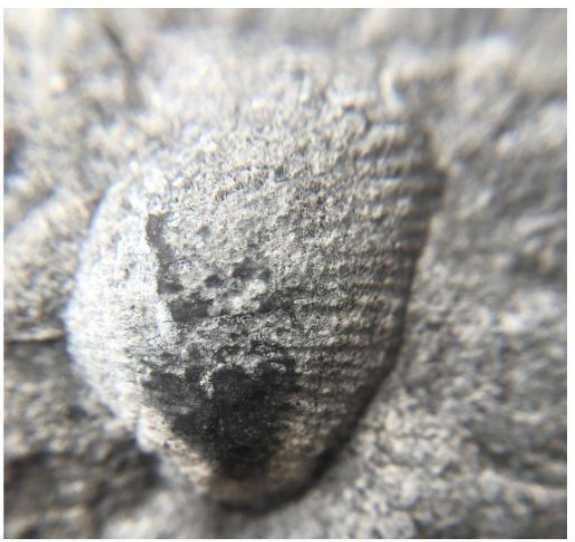
Brachiopod on the walls of the Church

Continue along Columcille street and turn right onto Harbour Street. Stop at the Church of the Assumption and explore the building stones of the walls and pillars outside the church and the building stones of the church itself. There are some amazing brachiopod fossils exposed on the church building. There are also lots of crinoids fossils here.