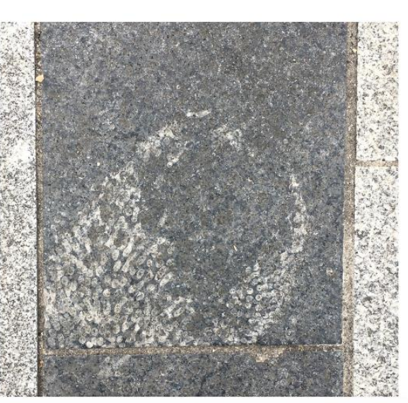
Colonial coral in O'Connor Square