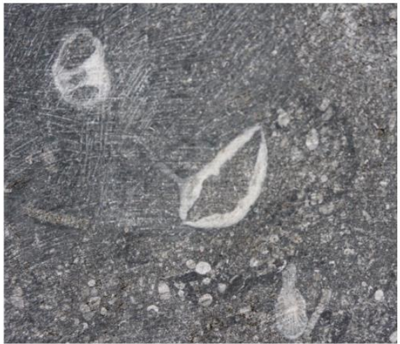
Brachiopods and corals outside the Court Office