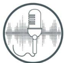
CREATIVE INDUSTRIES LAB