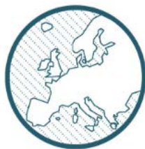
DIVISION FOR INTERNATIONAL COOPERATION