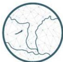
PANNONIA OFFICE FOR LOCAL DEVELOPMENT