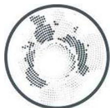
DIVISION FOR PUBLIC POLICY AND IMPACT ASSESSMENT