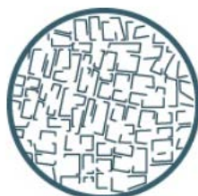
DIVISION FOR URBAN AND REGIONAL DEVELOPMENT