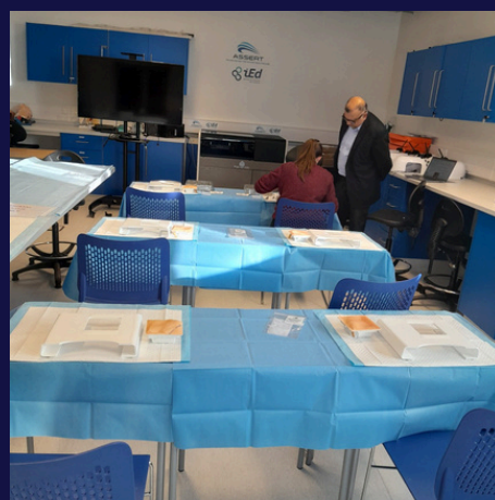
Research/Minor Skills Lab