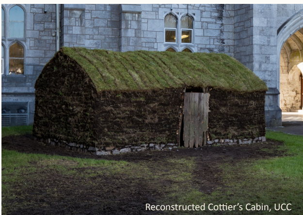
Reconstructed Cottier's Cabin, UCC

Poverty was widespread by the early 1840s and efforts to promote agricultural improvement had mostly failed. Three million landless labourers and cottiers existed without regular employment. The poorest of the poor lived in one-roomed mud cabins with a patch of land on which to grow potatoes.