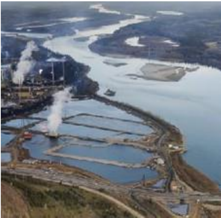
Tar sands, Alberta (thesis)