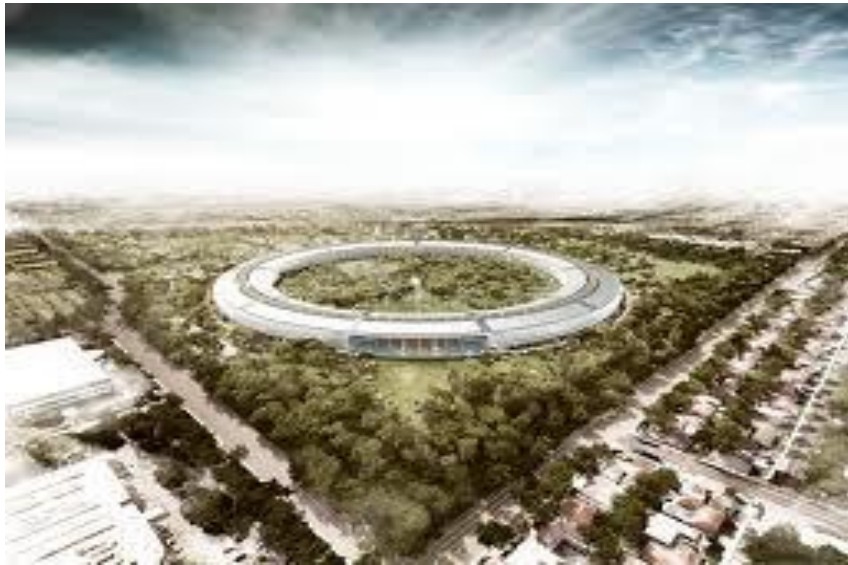
Apple City, Cupertino CA 2013