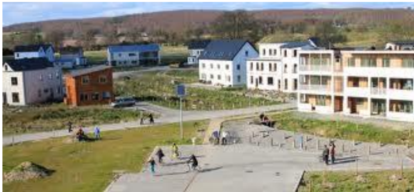
Cloughjordan eco village, Ireland