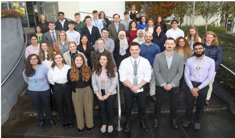
Photo 2: UCC and NUI Galway oral and poster presenters at the 7th Annual Atlantic Corridor Medical Student Research Conference, which was held at the Clinical Sciences Institute, University Hospital Galway.

As described above RPAC has facilitated research supports at undergraduate and postgraduate level in the School of Medicine. On review of activities over the past year the Committee is concerned with the limited funds available for research stimulus and is hoping that the launch of UCC Futures may be able to stimulate further School and College funded initiatives to capture and stimulate research within the School.