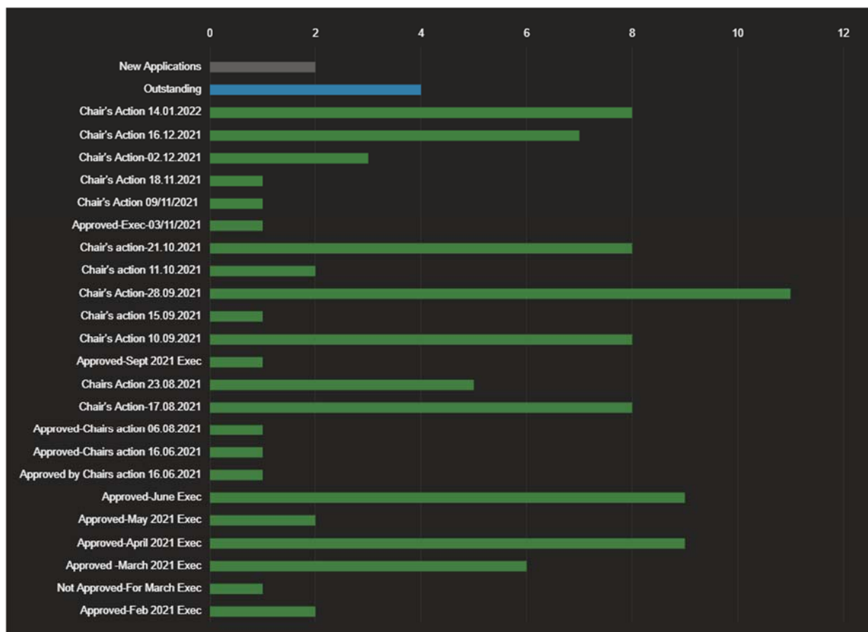
Figure 1. The numbers of postgraduate applications approved by date in 2021. The change in workflow from monthly approval to bi-weekly cycle is seen from October 2021 onwards.

Research Registration Change Requests are still processed outside of the CRM system. These requests include changes to Full Time / Part Time status, Start Date, Number of Years, Supervisors / Advisors, Thesis Title, Leave of Absence, Extension and Programme. PG Taught applications including Equivalency, Leave of Absence and Exemption applications are also processed outside of the CRM system.