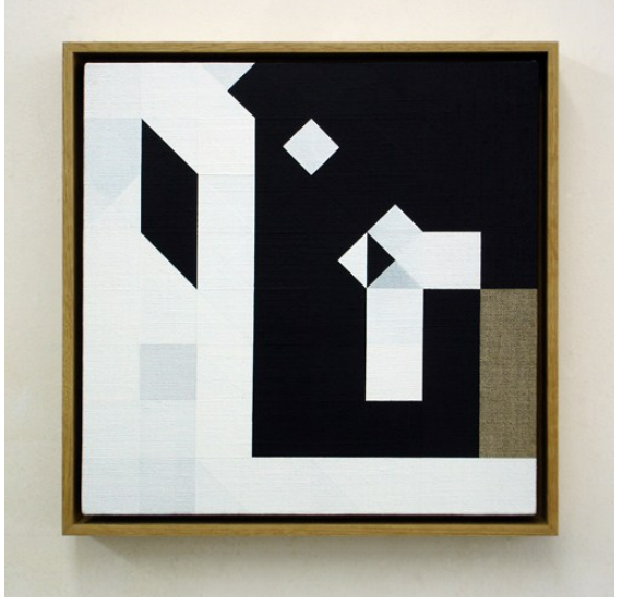
Tom Hackney: Chess Painting No.2 (Duchamp vs Crepeaux, Nice, 1925). Courtesy of the artist.

Visit: http://www.artworksireland.org, Email: info@artworksireland.org