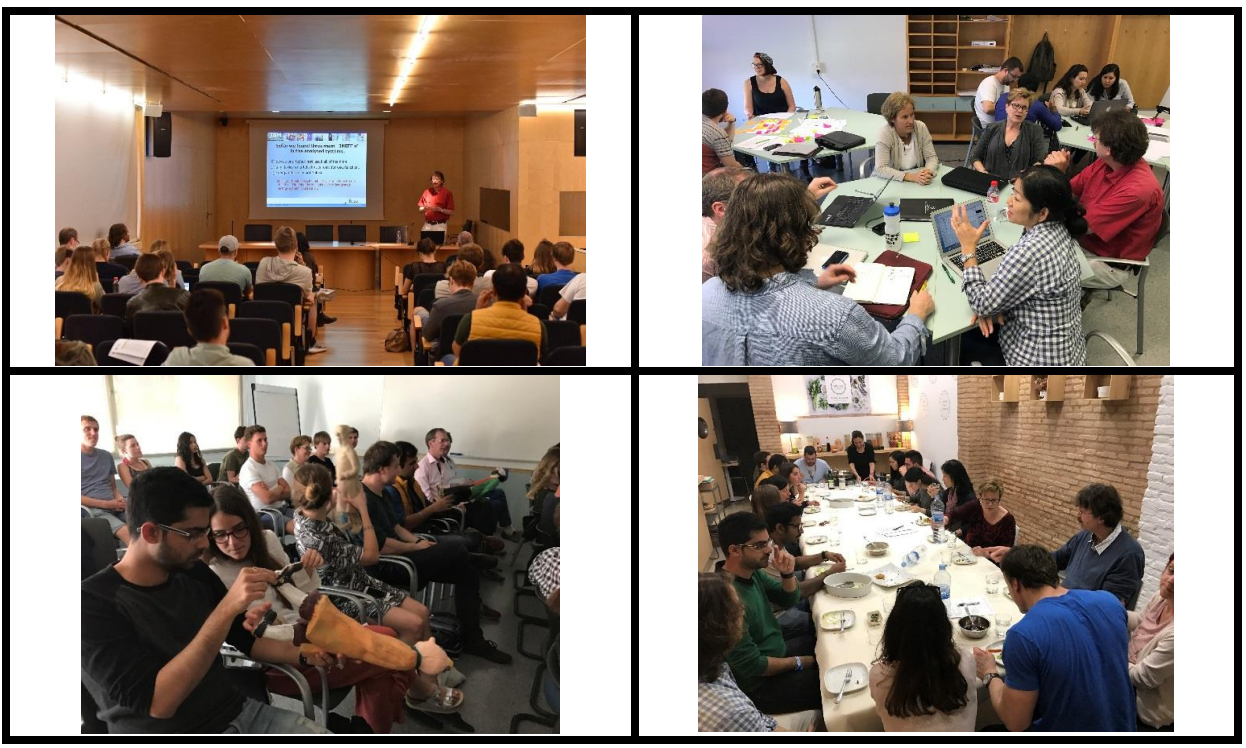
Figure 4 ISA Lab activities (clockwise from top left): a) 'Setting the scene' lecture, b) students and faculty groups during working session, c) group evening recreational meal, d) final presentations.

creative six hats concept (de Bono, 1985) for example, as students were encouraged to put on their 'creative' and 'feeling' hats to drive the ideation process, as these were often the ones that come less easily.