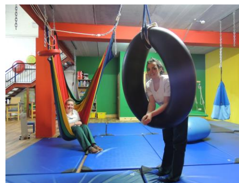
Picture: Year 2 students out on practice. May '16

Hand Hygiene – HSEland online certificate and a practical session