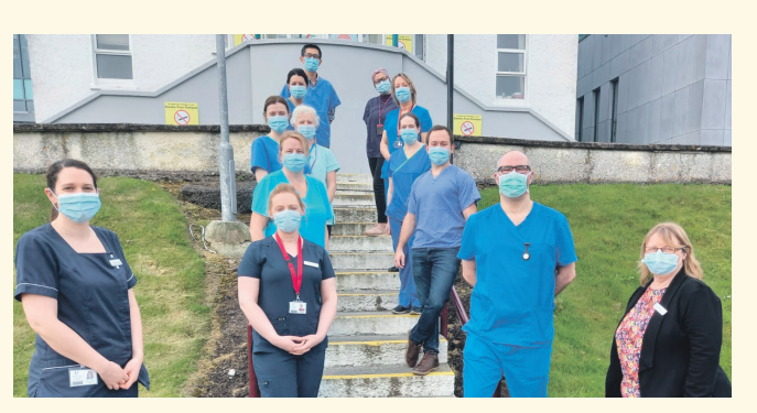
Local Injury Unit, Mallow General Hospital