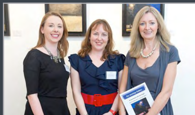
5. The Jennings Gallery