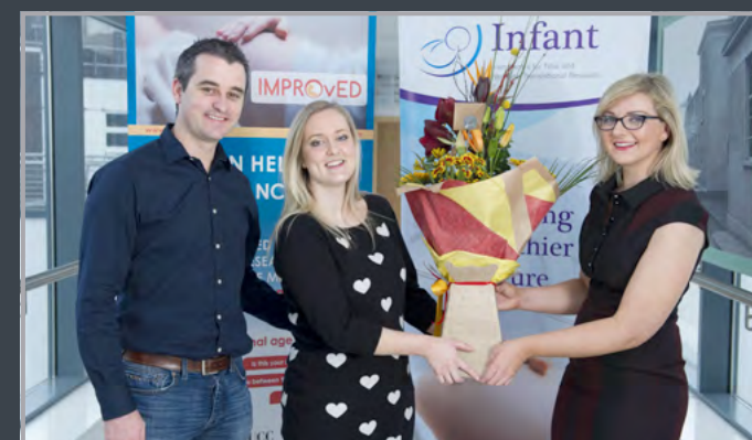
3. Pre-eclampsia project