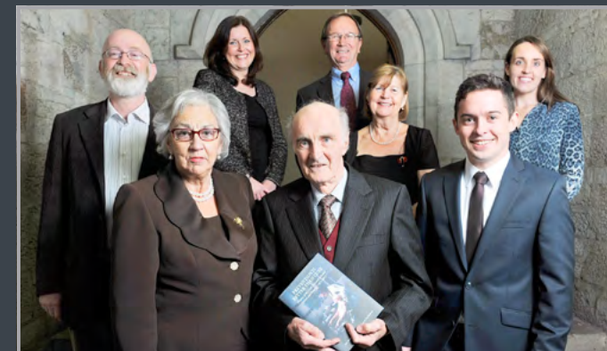
2. Dental Book Launch