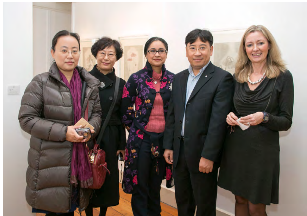
The visiting delegation to the exhibition of traditional Chinese Art