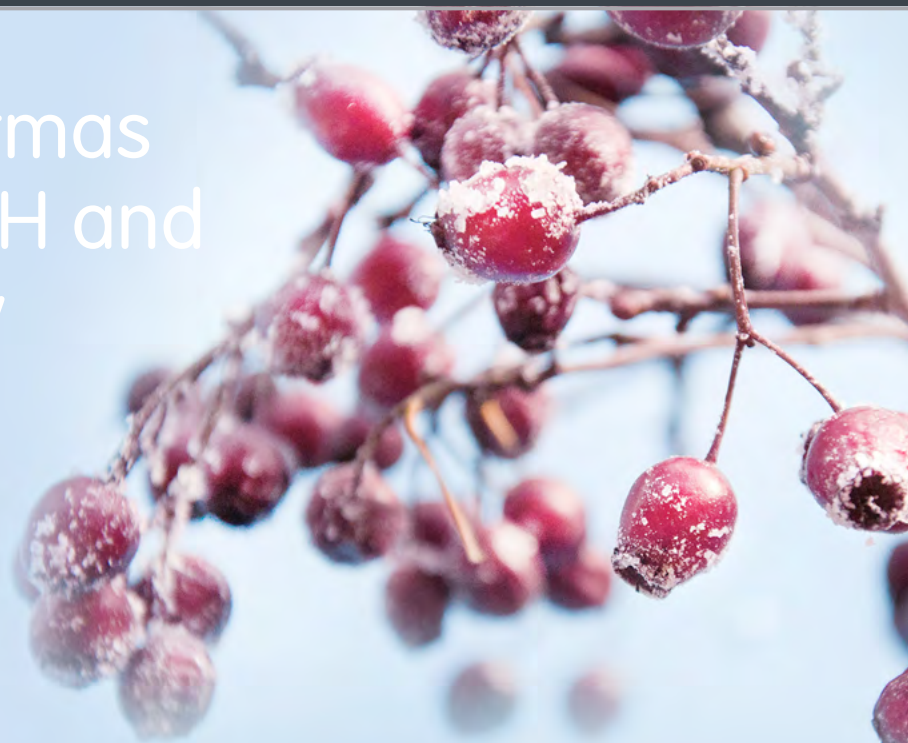
1. Welcome from Head of College of Medicine and Health

Happy Christmas to all at CoMH and a very happy New Year