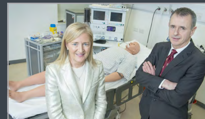
ASSERT and CAI