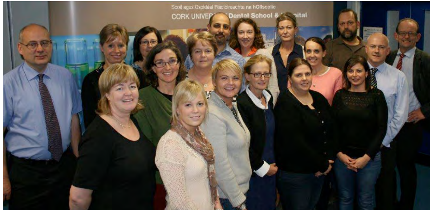
Pictured are participants & tutors