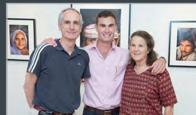
Iris of the East