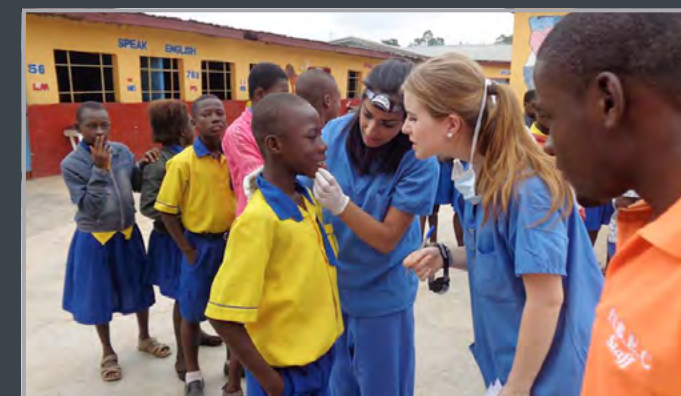
Outreach in Ghana