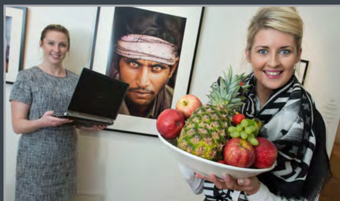
New online programme