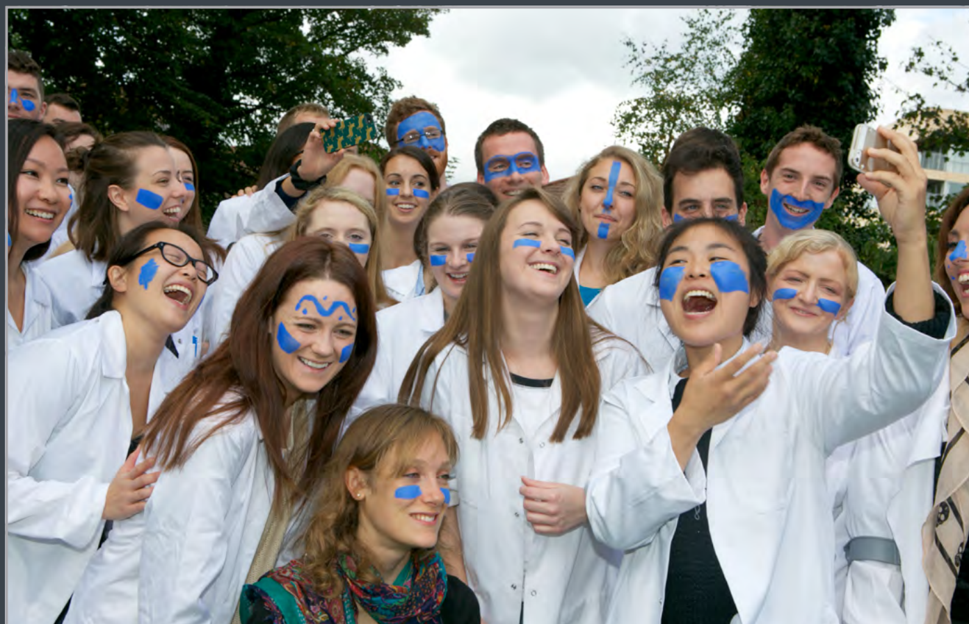
Going Blue in the Face!