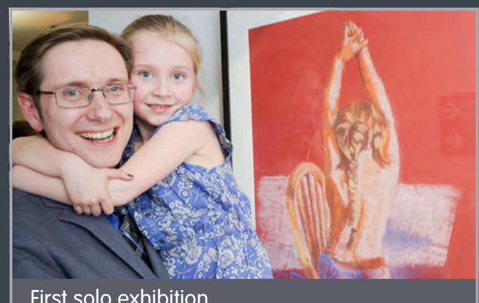
First solo exhibition