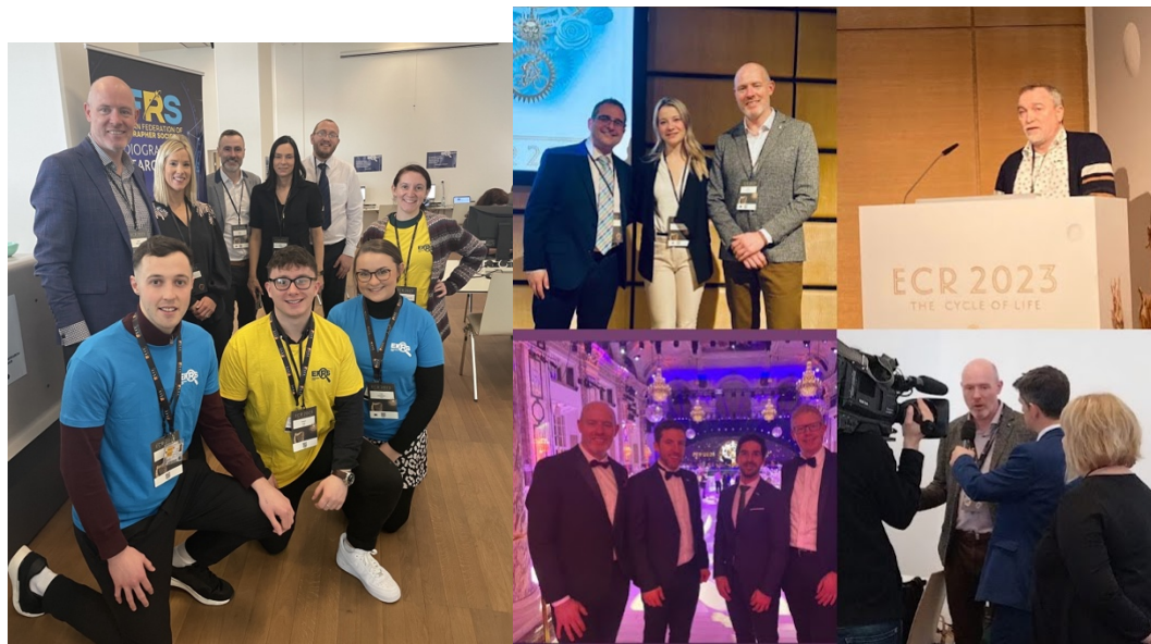
UCC academics, clinical colleagues and researchers present in the EFRS Research Hub at ECR2023.