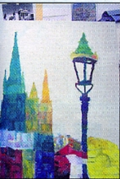
his paintings; he produces intricate, ngs.