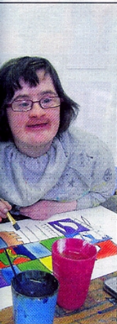
lows in her work and is currently illivan's Quay and at UCC.