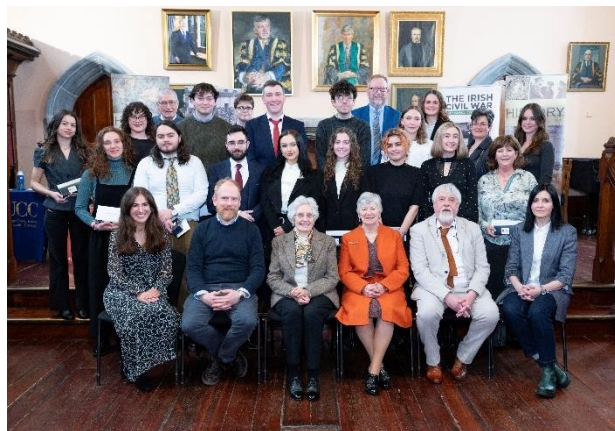
Group picture of prize recipients at the School of History prize-giving ceremony 2025, Aula Maxima, UCC. The prizes were awarded on the basis of performance in the previous academic year, 2023-24.

These are prizes for the best overall performance by a History student in each of the three years. Similar awards are offered for European Studies and History of Art students, though the prize recipients have yet to be decided. Another prize, the Alan McCarthy Prize in History, will be awarded for the best MA dissertation in Irish History submitted in 2025.