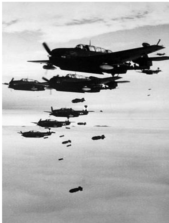
US Navy aircraft dropping bombs on Hokodate, Japan, in July 1945

https://www.ucc.ie/en/history/undergraduate/firstyearhistory/