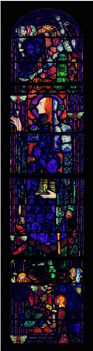
St. Gobnait window, Honan Chapel, UCC