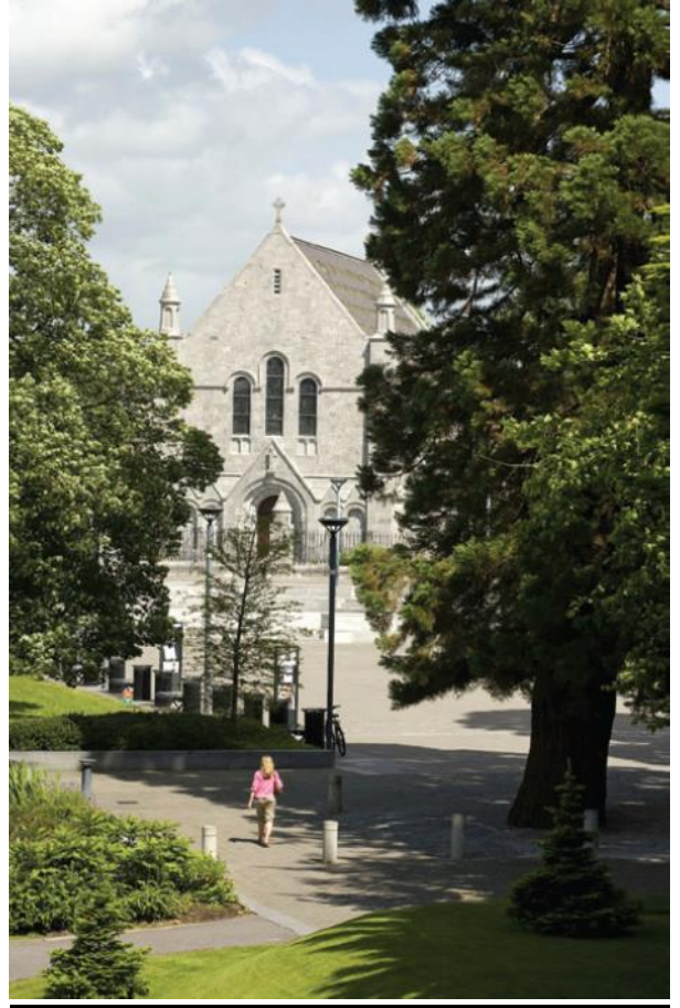
Honan Chapel, UCC

Where work is submitted up to and including 7 days late, 5% of the total marks available shall be deducted from the mark achieved. Where work is submitted up to and including 14 days late, 10% of the total marks available shall be deducted from the mark achieved. Work submitted 15 days late or more shall be assigned a mark of zero. A penalty exemption scheme is in operation. Please see UCC History's website for details and documentation.