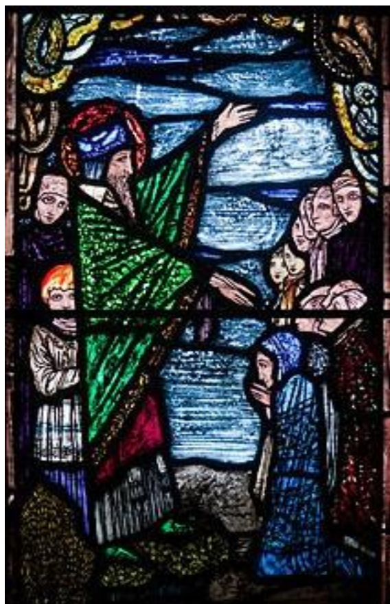
Harry Clarke depiction of St Patrick, St. Michael's Church, Ballinasloe, 1925

https://www.ucc.ie/en/history/undergraduate/secondyearhistory/