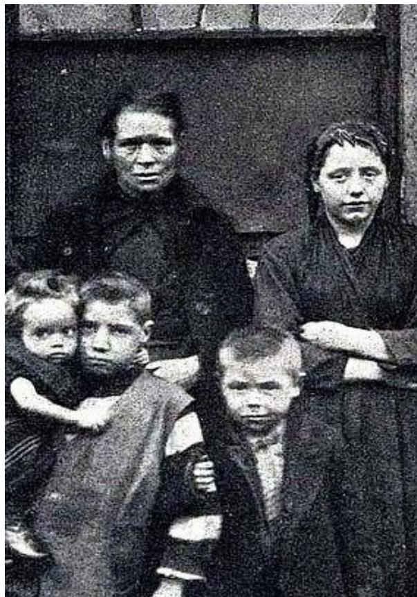
Dublin tenement residents, 1901

https://www.ucc.ie/en/history/undergraduate/thirdyearhistory/