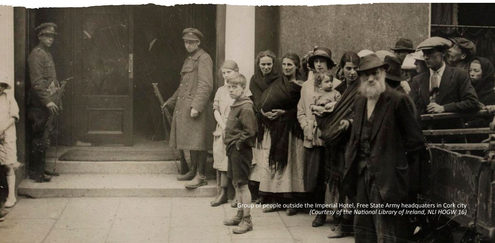
Group of people outside the Imperial Hotel, Free State Army headquarters in Cork city