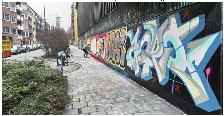
Street art in Malmö, Sweden.

In the final year of the BA in Geography you have the opportunity to focus on your particular interests in the discipline, as a wide range of thematic modules is offered.