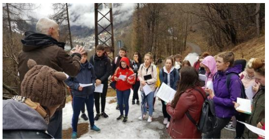
Field group studying mountain landscapes in Italy.