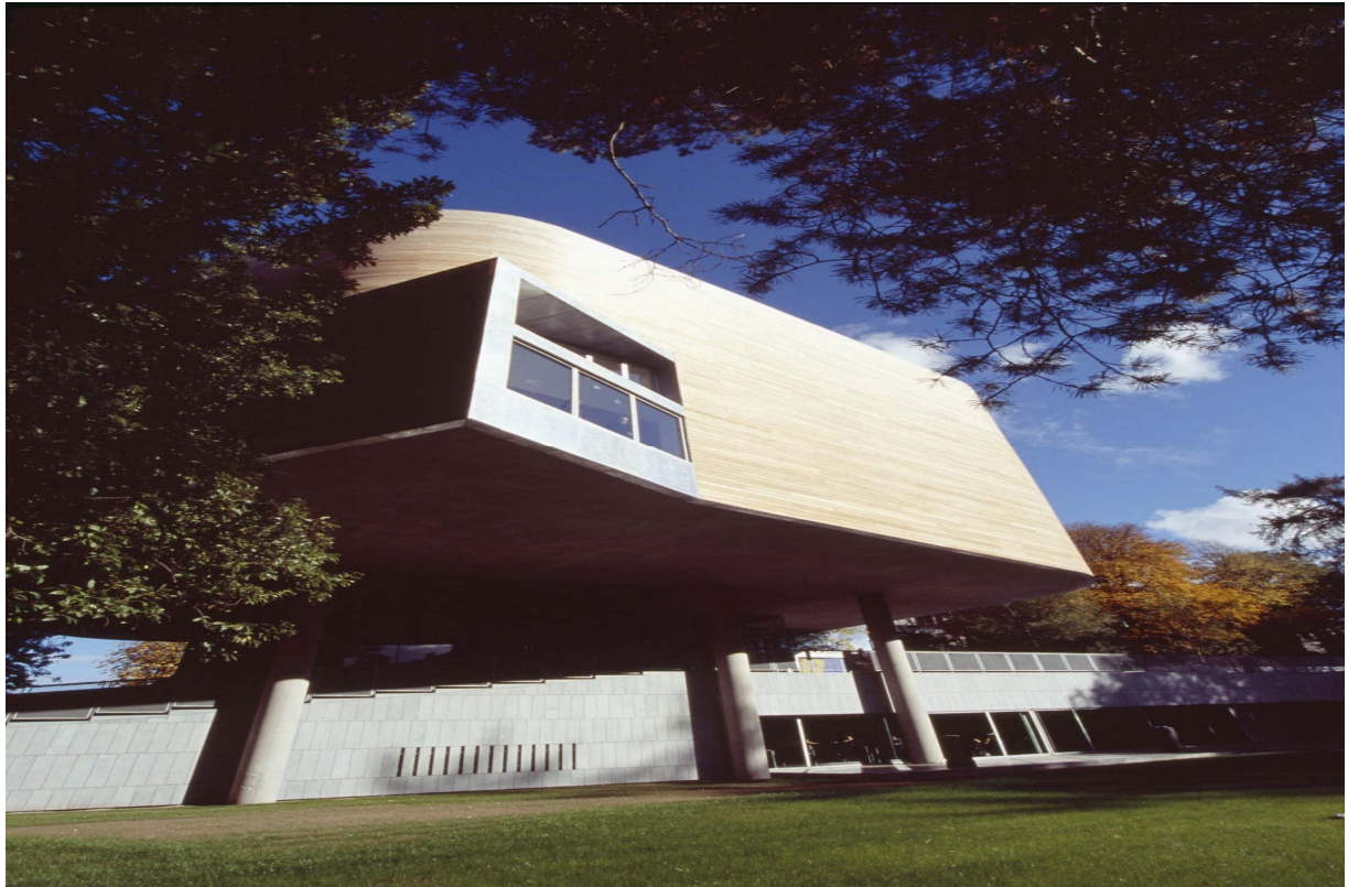
The Glucksman Gallery

Should you have any queries concerning this expenses policy or require any further assistance or additional information, please contact the Department of Human Resources, Recruitment Office on 021 490 3603 or e-mail: recruitment@per.ucc.ie