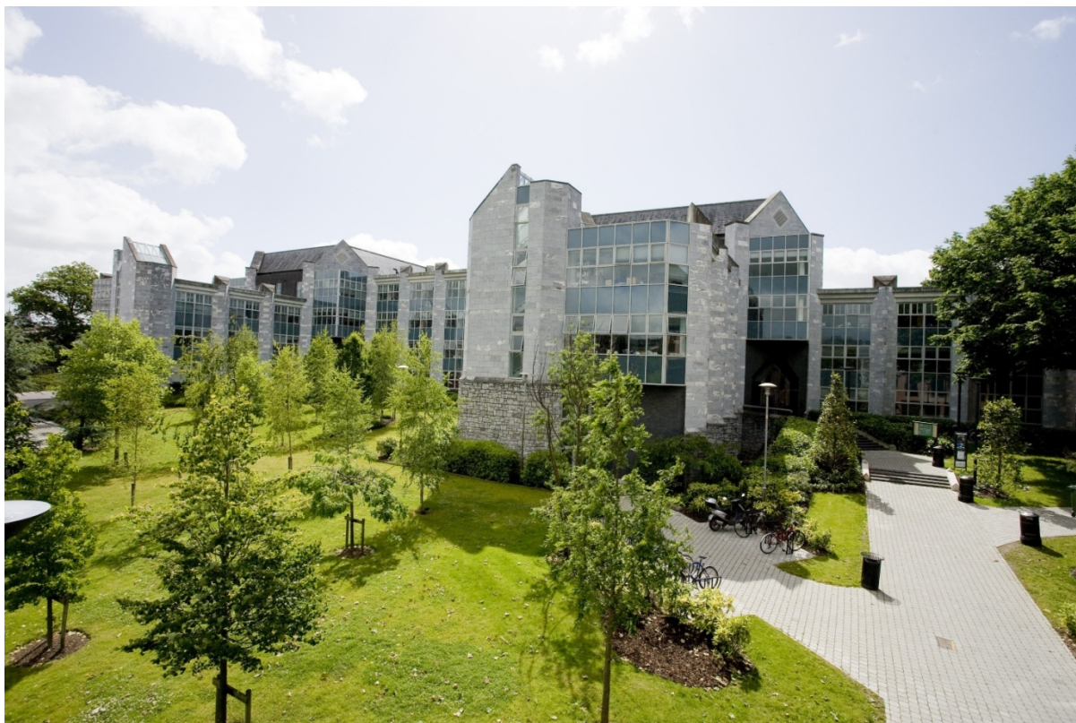
The O'Rahilly Building, Business and Humanities

Please note: The standard non-refundable visa application processing fee is €60 for a single-journey visa. This will be valid for one entry into the State within 90 days of issue. If you then wish to leave the State (this includes travel to Northern Ireland) you will then need a re-entry or multiple-entry visa to re-enter the State.