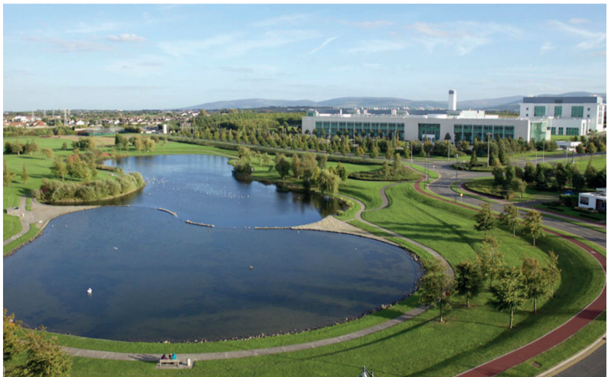
Pfizer's Grange Castle plant in West Dublin is one of three sites where UCC ACE's Higher Diploma in Leadership Development is held, alongside Newbridge and Ringaskiddy. There are currently five HDip courses being delivered across the three locations.

"Being able to go back and learn and get the qualification was really important to me and it's delivered in a way that you understand. The breakout rooms really helped and you get to know people from oth-