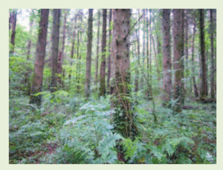
A Norway spruce/Scots pine mix plantation, planted on the site of former woodland and supporting a large number of woodland plant species.

These findings suggest that there is significant scope for the planning and management of plantations so that they support more woodland species, and plant communities closer to those of semi-natural woodlands.