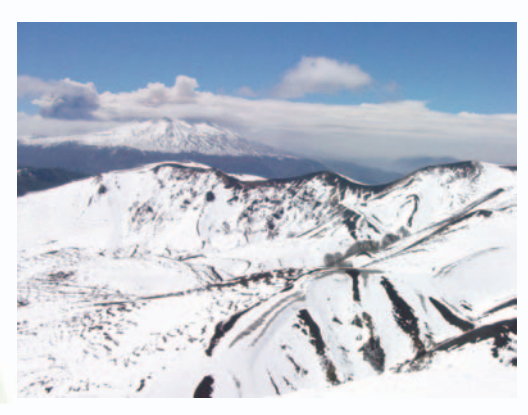
View of an erupting volcano, part of the Puyehue-Cordón Caulle volcano complex and first began erupting in June 2010.