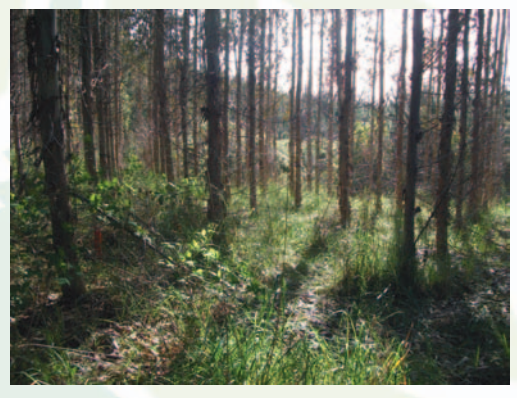
Plot at field trial using herbicide. The eucalypts are this big after just 6 years.

The conference was a great success, though not as well attended as previous years, but those that did make it felt that the very long journey was worth it. It was the first time the conference was held in South America which helped reinforce one of the central themes of IURFO which is the facilitation of the transfer of knowledge to a worldwide audience. And by following the philosophy of the Cost Action meetings (supporting cooperation between EU scientist and researchers) the organisers of IURFO hope that the same collaboration and sharing can be achieved on the world stage.