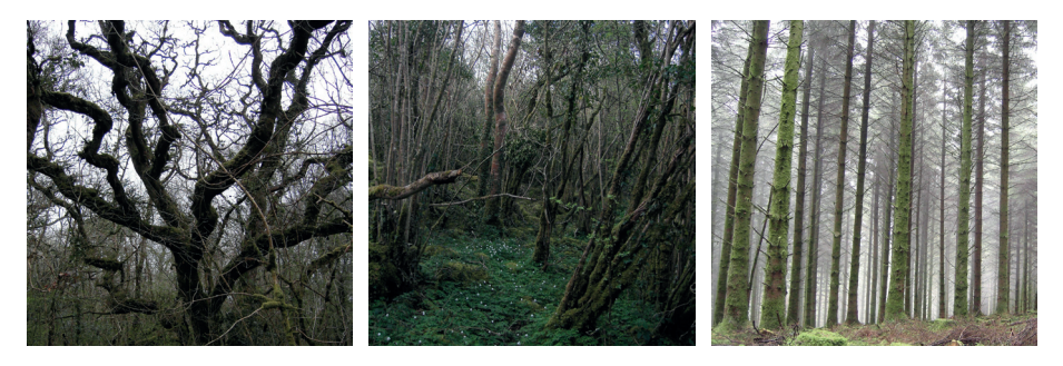
Figure 3: From left to right: native oak woodland, native ash woodland and mature non-native Sitka spruce plantation forest.

Sitka spruce plantations (Wilson et al. 2010). Non-crop vegetation in roads, rides and other unplanted areas was also associated with higher bird diversity. The higher bird species richness in these areas was, in large part, due to the presence of species that are known to be associated with broadleaves, and so responded to the increase in the cover of shrubs and broad-leaved trees (Figure 5). Non-crop vegetation can also have a positive effect on birds by enhancing the structural complexity of forest vegetation. This suggests that providing an opportunity for native trees and shrubs to grow by leaving unplanted areas in stands may partly compensate for the simpler structure and lack of broadleaved vegetation in areas of closed canopy conifers (Roycroft et al. 2008, Wilson et al. 2010). The magnitude of the positive effect of such unplanted areas will likely be determined by their overall size, with larger areas providing habitat for a greater number and diversity of birds. When incorporating an unplanted or open area in a forest there are advantages both of dispersing this area between a number of individual small spaces (to maximise the influence of non-crop vegetation on the wider forest (Bibby et al. 1989)) of configuring it as a single large area (to better suit species with large habitat requirements (Langston et al. 2007)).