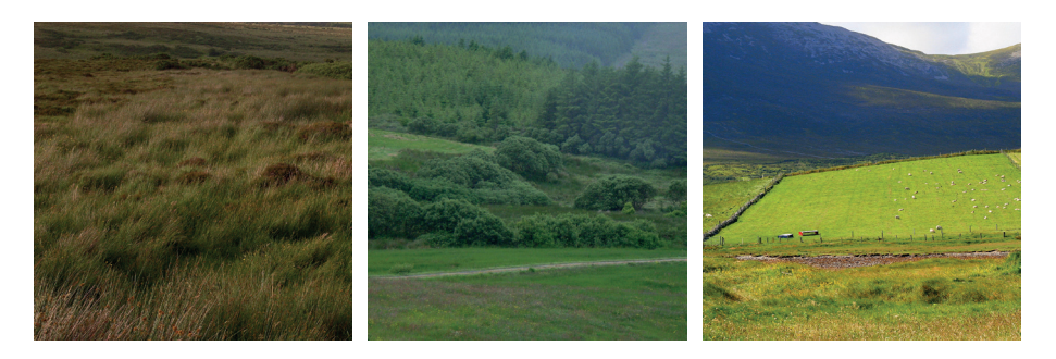
Figure 2: From left to right: Peatland, Wet grassland and Improved grassland habitats.

found in forest plantations. Because of its relatively low value for bird communities, afforestation of intensively managed grassland has a more positive impact on bird diversity than afforestation of low intensity agricultural grassland, particularly where the latter has high levels of in-field shrub cover or supports open habitat specialists (Wilson et al. 2012). Peatland sites tend to have low bird diversity, but support relatively high densities of the open habitat specialists, meadow pipit and skylark.