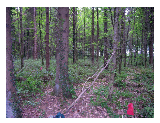
Figure 4: Mixed Norway spruce and oak plantation forest.

the pre-thicket stage, levels of non-crop shrub cover are higher than in equivalently aged, first commercial rotation forests. As a result, several species of birds that breed in shrub-rich habitats are more abundant in second rotation pre-thicket forests (Figure 6) than in recently established afforested sites. Migrant songbird species have been found at significantly lower densities in closed canopy than in Thicket and Pre-thicket forests (Figure 6). The bird communities of these early stages are markedly distinct from those of closed canopy plantations. In addition to holding high densities of several migrant songbird species, second rotation pre-thicket stands also support resident species of conservation concern (Table 1). However, these species are not found in plantations following canopy closure at the mid rotation stage (Figure 6), but are replaced by a more generalist bird community, with high densities of just a few common species.