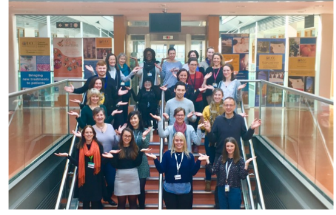
Pictured above: School of Public Health and National Suicide Research Foundation members striking the pose for International Women's Day 2019.

On March 8<sup>th</sup>, staff and PhD students from the School of Public Health and the National Suicide Research Foundation participated in the International Women's Day (IWD) 2019 campaign #BalanceforBetter by striking the balance for better pose (pictured right). This year's IWD campaign theme is centred around building a gender-balanced world and events will continue