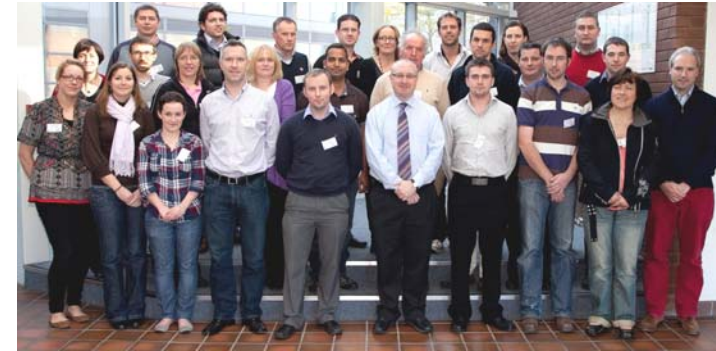
Attendees of the Cheese Science and Technology Training Course delivered by FITU in 2010