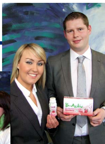
Members of the New Food Product Development teams (from left to right): Souper Grass, B-Activ and The Right Whey.