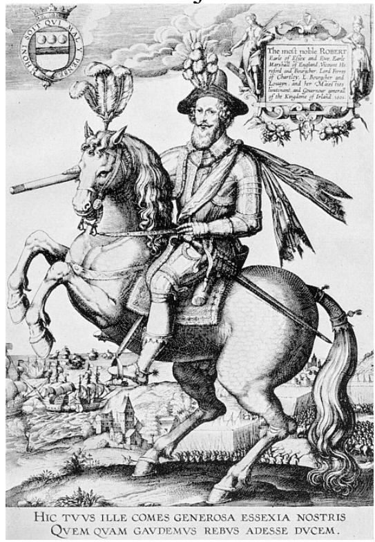
Essex victor at Cadiz

The man lionised as 'The Hero of Cadiz' was the popular choice for the job.