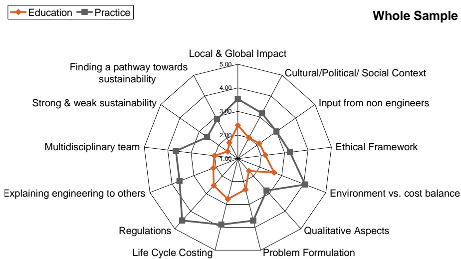
Figure 3. Ranking of sustainability principles in education and practice, whole sample

through the decision making structure of a modern corporation. These are complex organisations where many of the key decision makers are not of a technical background.