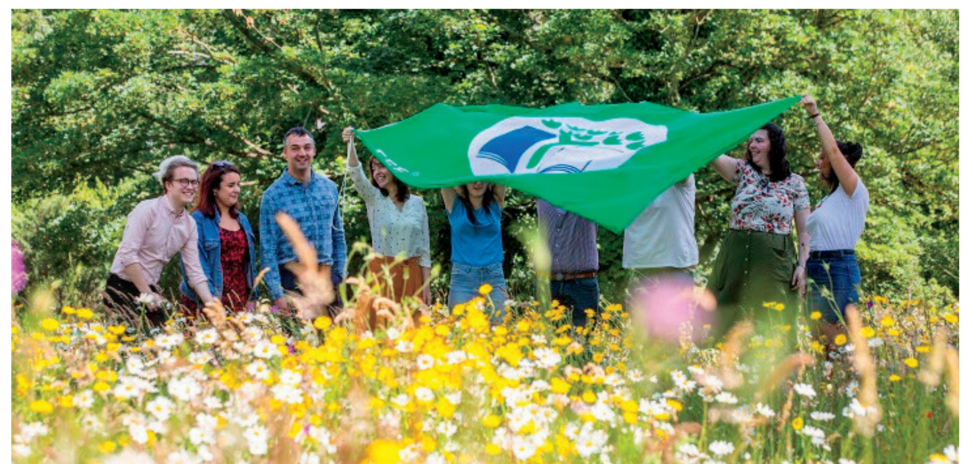
Photo 1: Sowing of a wildflower meadow at Perrott's Inch to promote biodiversity