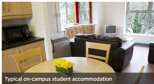
Typical on-campus student accommodation