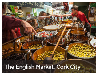
The English Market, Cork City