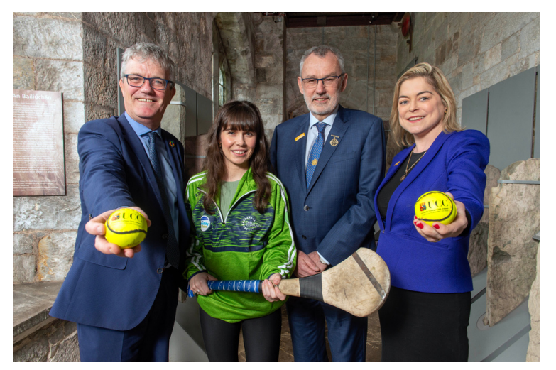
Launch of the UCC GAA's Healthy Clubs Initiative