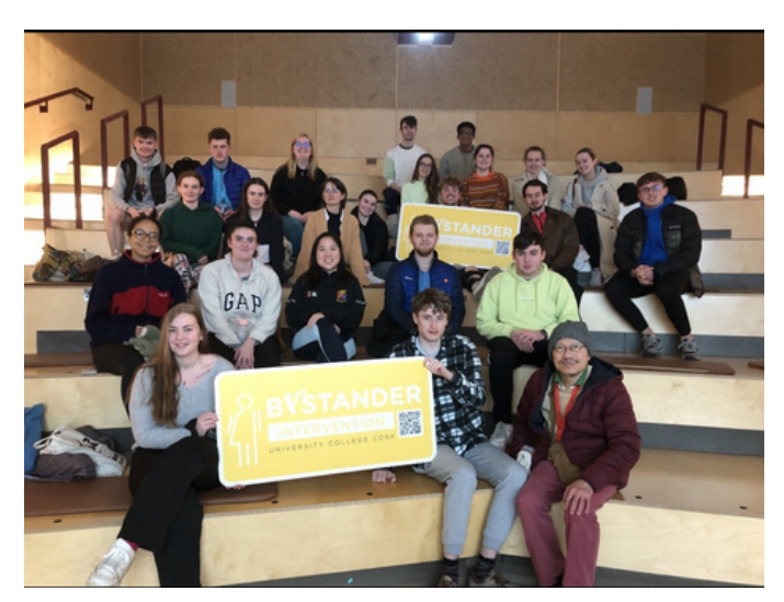
UCC Respect officers participate in Bystander Intervention Training