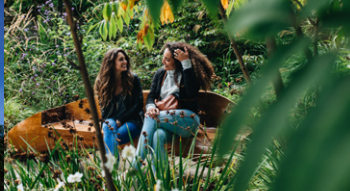
NANO NAGLE PLACE