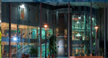
UCC STUDENT CENTRE