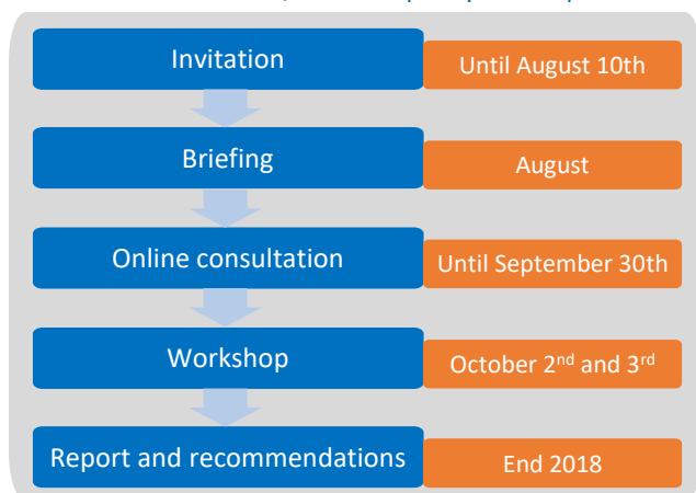
Figure 1.2 Flow diagram of technical feedback process