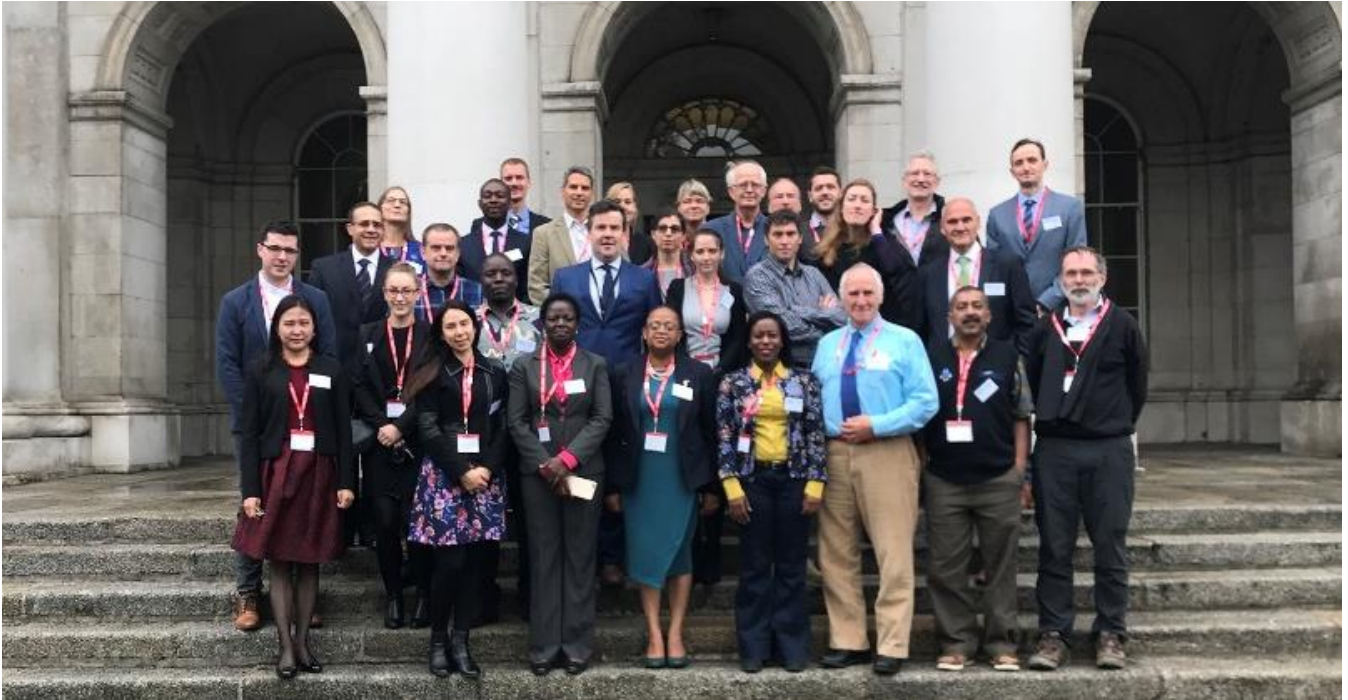
Workshop participants on steps of Customs House, Dublin, Ireland

The continued improvement of the methodology based on feedback is fundamental to indicator 6.3.2 implementation and without which, it will be difficult to: