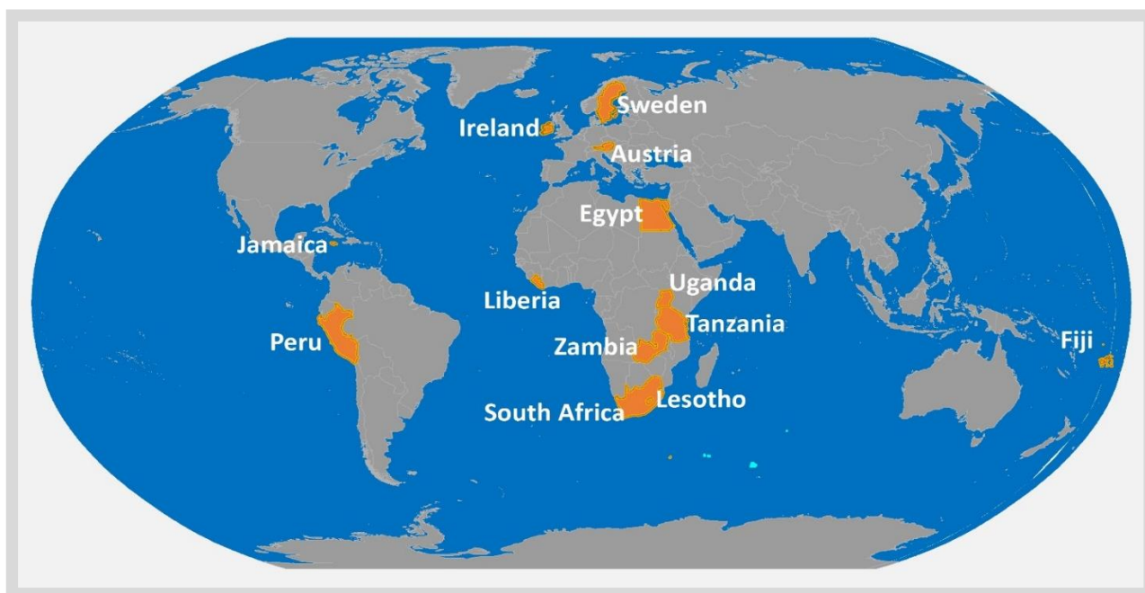
Figure 2.1 Countries that presented detailed case studies at the Dublin workshop

Each country representative was invited to describe the experience from their country during the 2017 data drive. A three-slide PowerPoint template was supplied to each country representative to standardise responses and ensure comparability. Slide one asked for information on the indicator 6.3.2 score and the metadata reported during the 2017 data drive, slide two on the main challenges faced, and slide three on main suggestions for improvements.