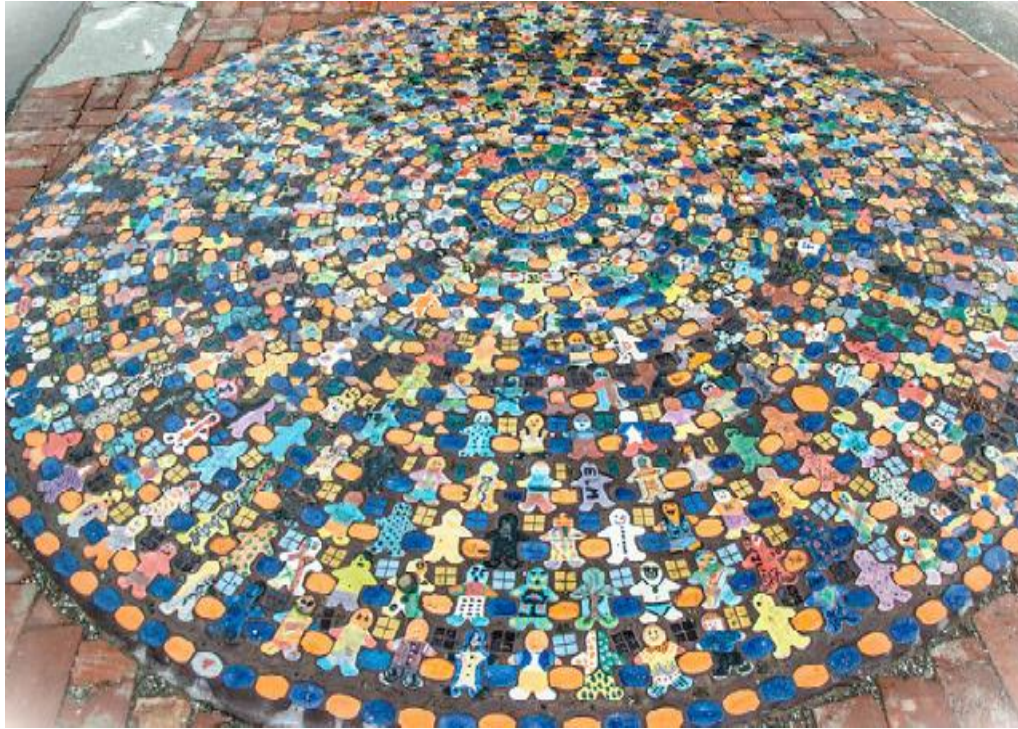
PHOTO: 'ALL JOIN HANDS' BY JOCELYN KINGHORN (LICENSED UNDER CC BY-SA-2.0)