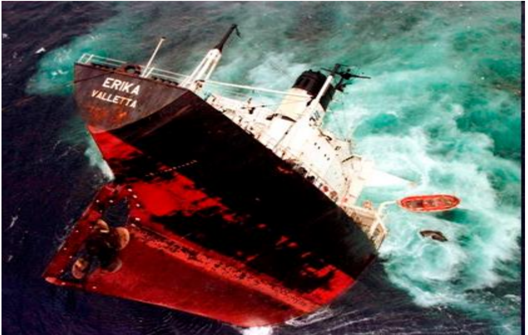
12 December 1999 : Erika sinks in Bay of Biscay 60 nautical miles off Brittany ( French EEZ)