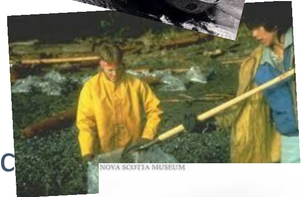
NOVA SCOTIA MUSEUM