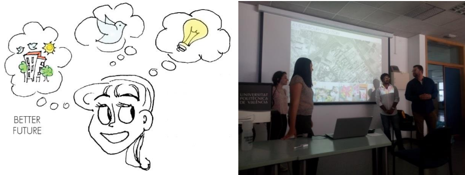
Figure 5 'Pilar' and the associated group presentation

Whilst all the projects acknowledged the principle of stakeholder engagement as being essential in assessing and progressing the concepts developed, one group brought that notion into their mechanism of delivery, presenting their concept from the point of view of an individual stakeholder, a fictional local thirty year old woman named Pilar (Figure 5), who took it upon herself to engage her local community in a social regenerative project, and whose enthusiasm and leadership helped draw down funds and support from the city's municipal budget and a visit from the mayor.