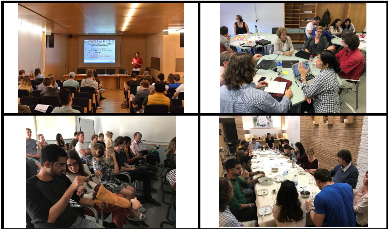
Figure 4 ISA Lab activities (clockwise from top left): a) ‘Setting the scene’ lecture, b) students and faculty groups during working session, c) group evening recreational meal, d) final presentations.

creative six hats concept (de Bono, 1985) for example, as students were encouraged to put on their ‘creative’ and ‘feeling’ hats to drive the ideation process, as these were often the ones that come less easily.