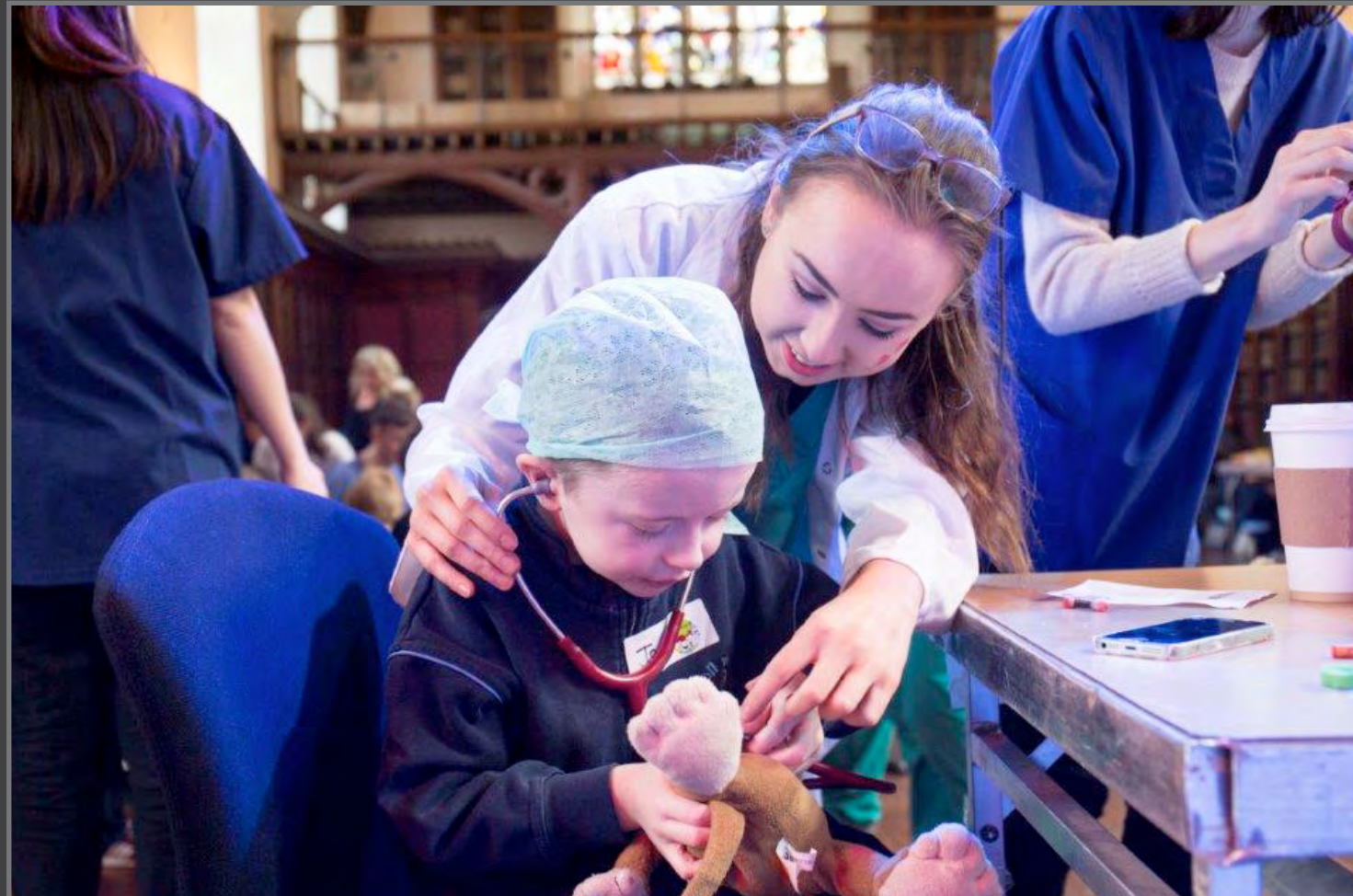
Annual Teddy Bear Hospital

CoMH eNews is intended for circulation among staff and students of the College of Medicine and Health, UCC. Extracts from CoMH eNews should not be published without the permission of the editor.