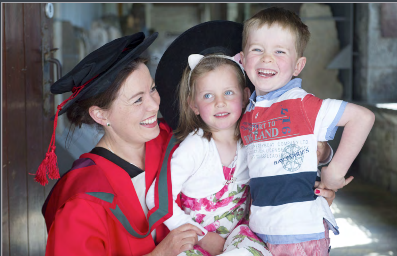
College of Medicine and Health Conferings