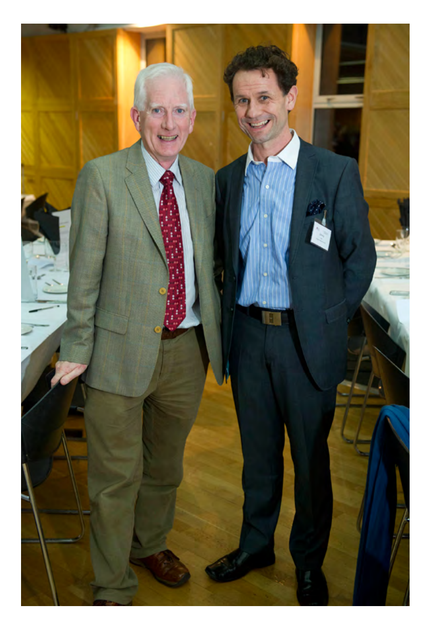
Photographed are more of the delegates who met at the recent Clinical Forum.