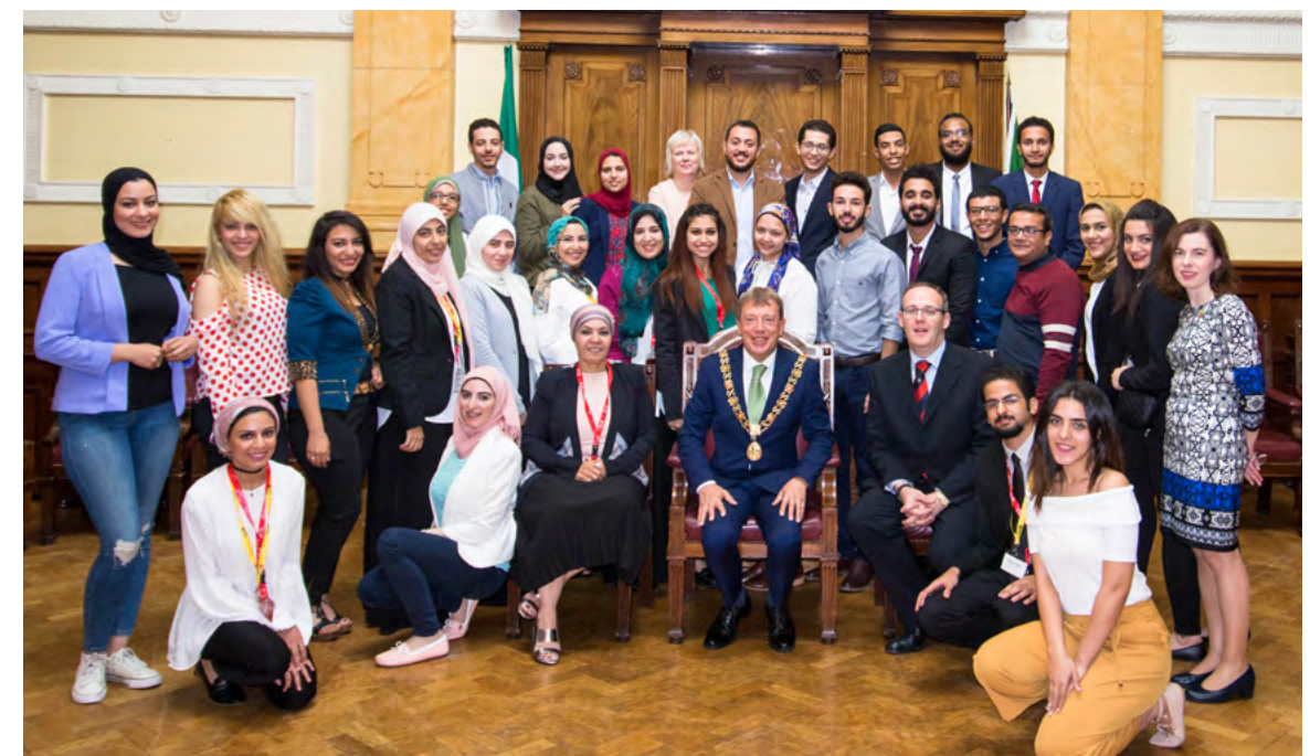
Pictured above: FUE group with Lord Mayor of Cork, Cllr Tony Fitzgerald and UCC staff at Cork City Hall.