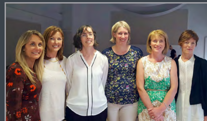
Visual Thinking Strategies