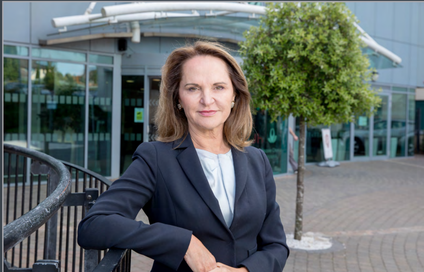
New Head of College of Medicine & Health