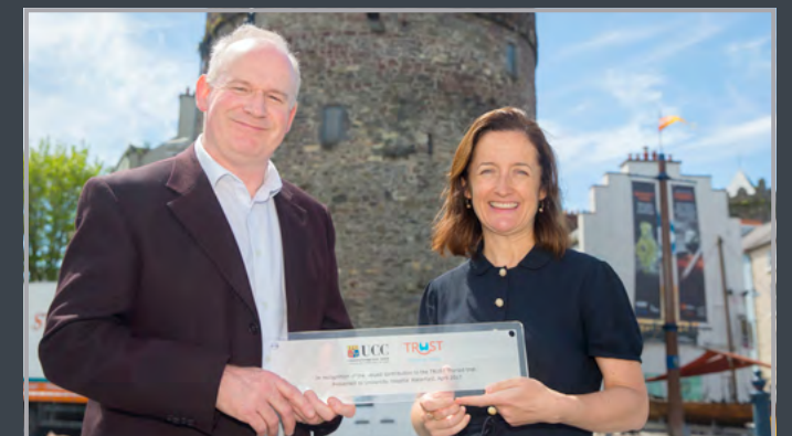
TRUST Clinical Trial