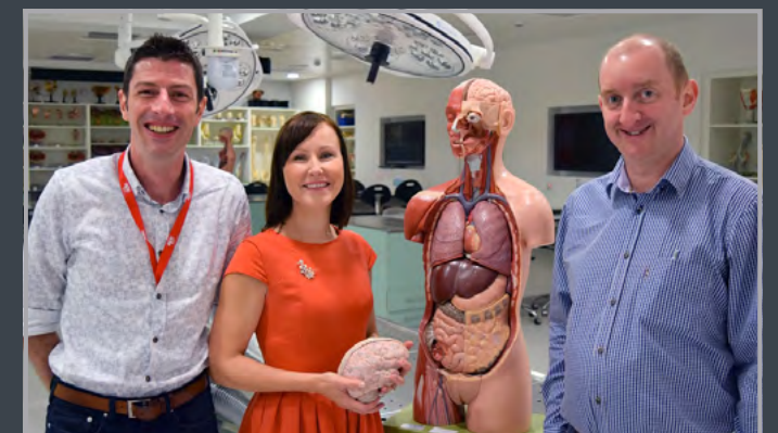
APC Microbiome Institute