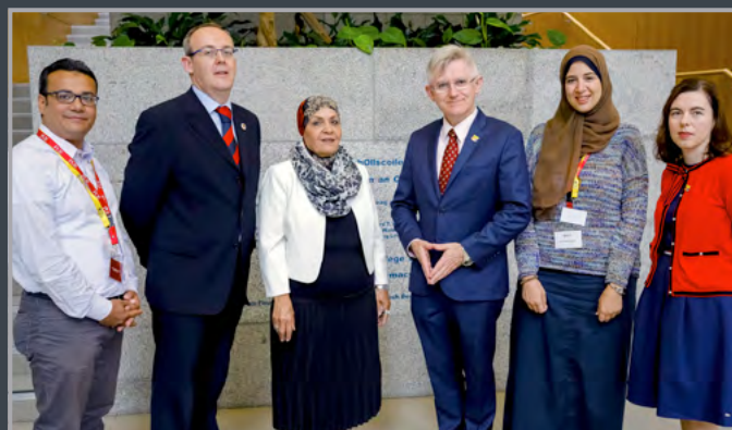
School of Pharmacy