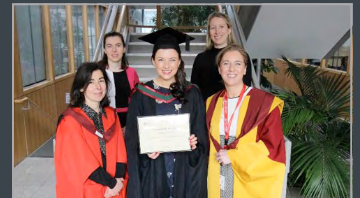
Course of the Year