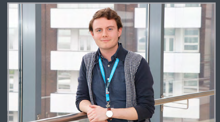
Graduate of the Year