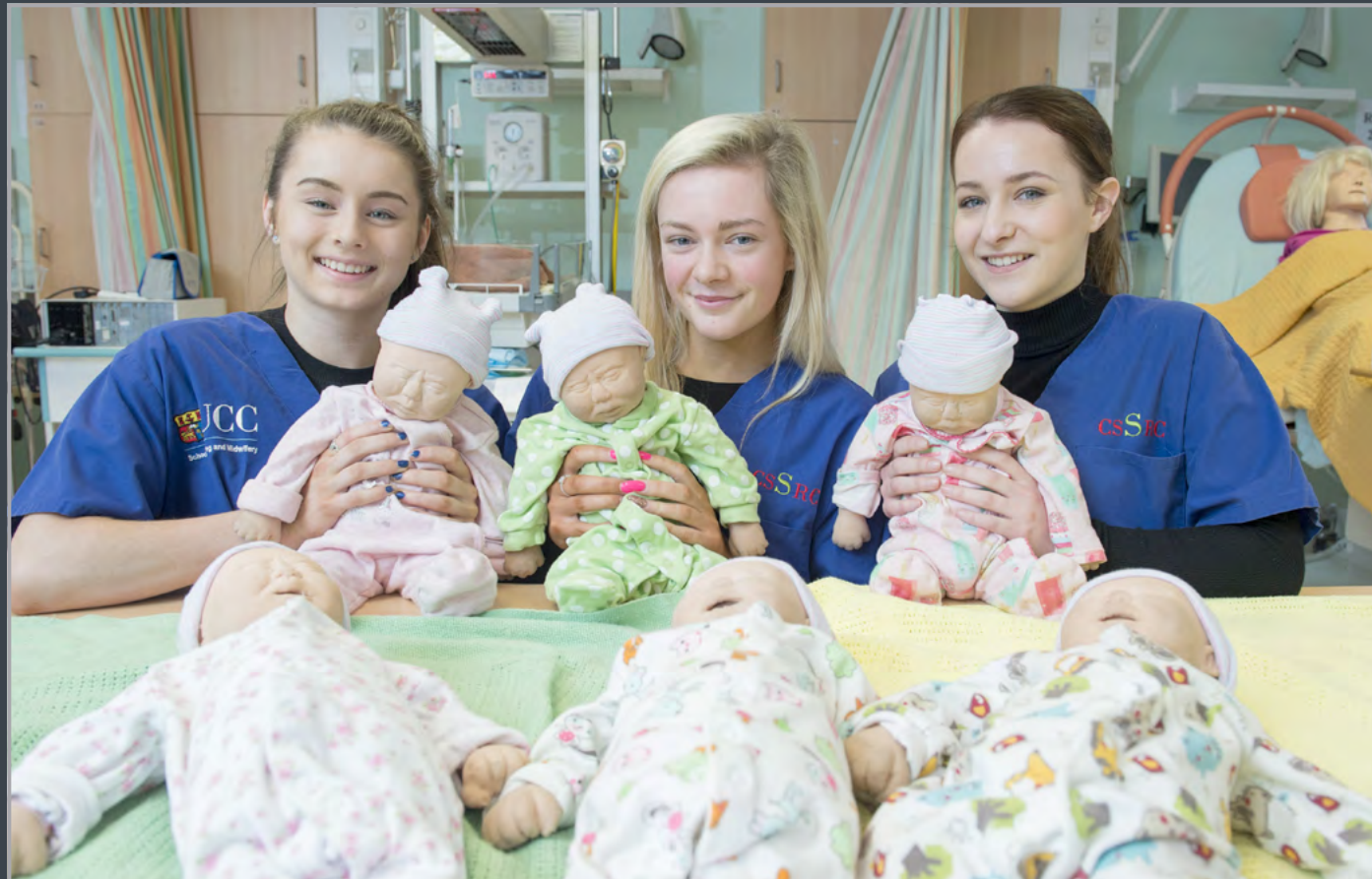
HeadStart for Nursing and Midwifery