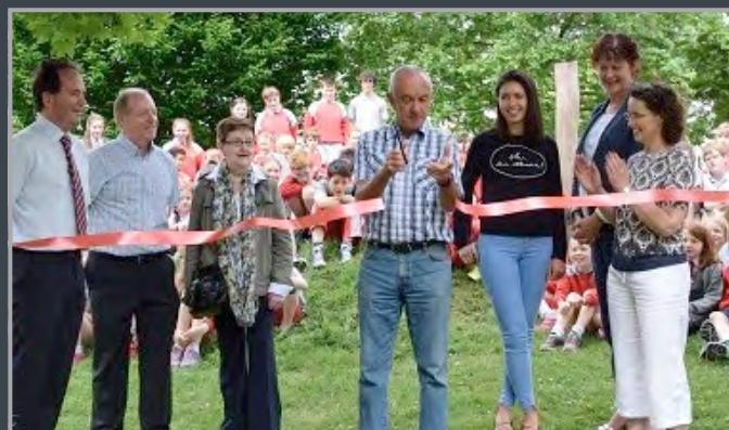
Desire to Design