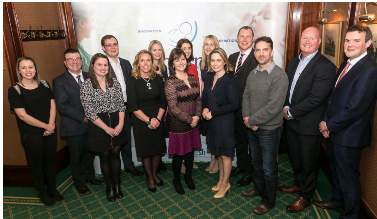
Above: PiNPOINT Investigator Team