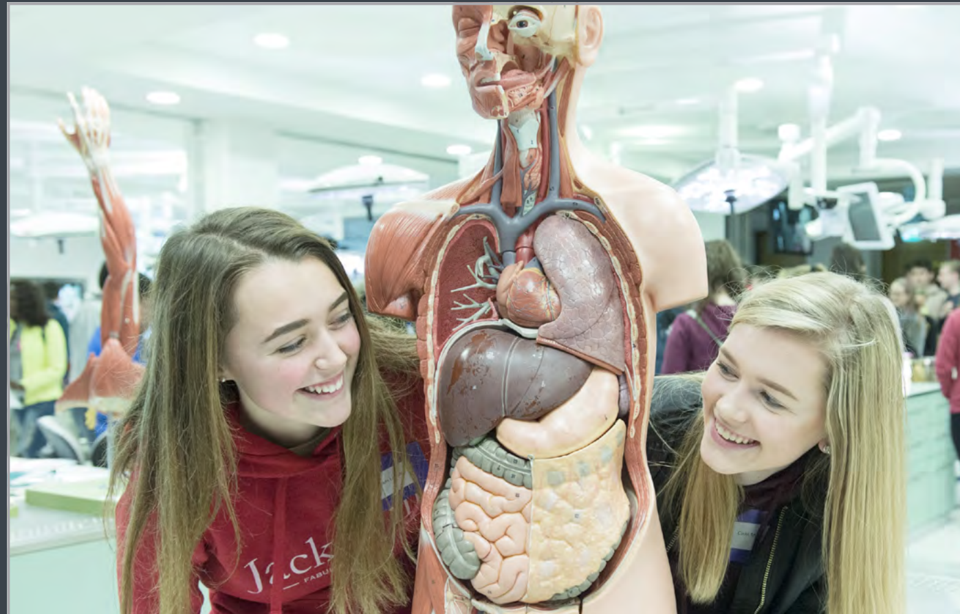
Prep for Med